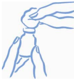
Figure 1: Wipe top with alcohol