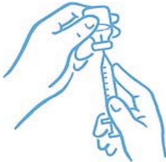
Figure 4: Tip in liquid