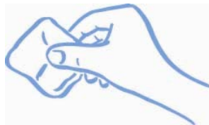
Figure B: Press (don't rub) with gauze or cotton