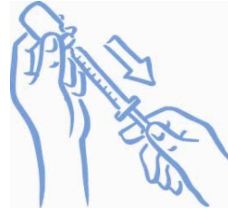
Figure 5: Extract correct dose