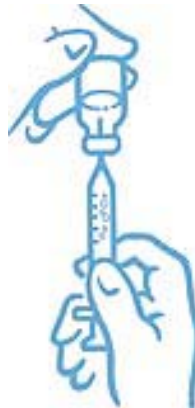
Figure 6: Remove air bubbles and refill syringe