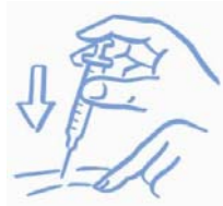
Figure A: Lightly pinch the skin and inject as instructed