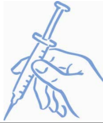
Figure 7: Ready to inject